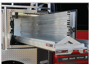
PAC TRAC Tool Mounting