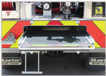
Rear Slide-Out Tray