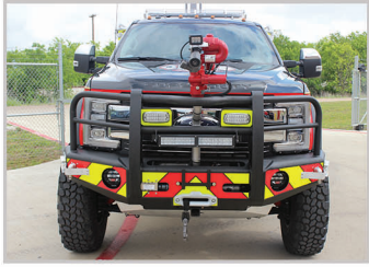
Custom Alum. Bumper