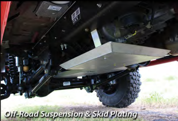
Off-Road Suspension & Skid Plating