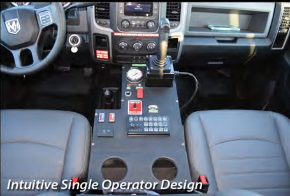
Intuitive Single Operator Design