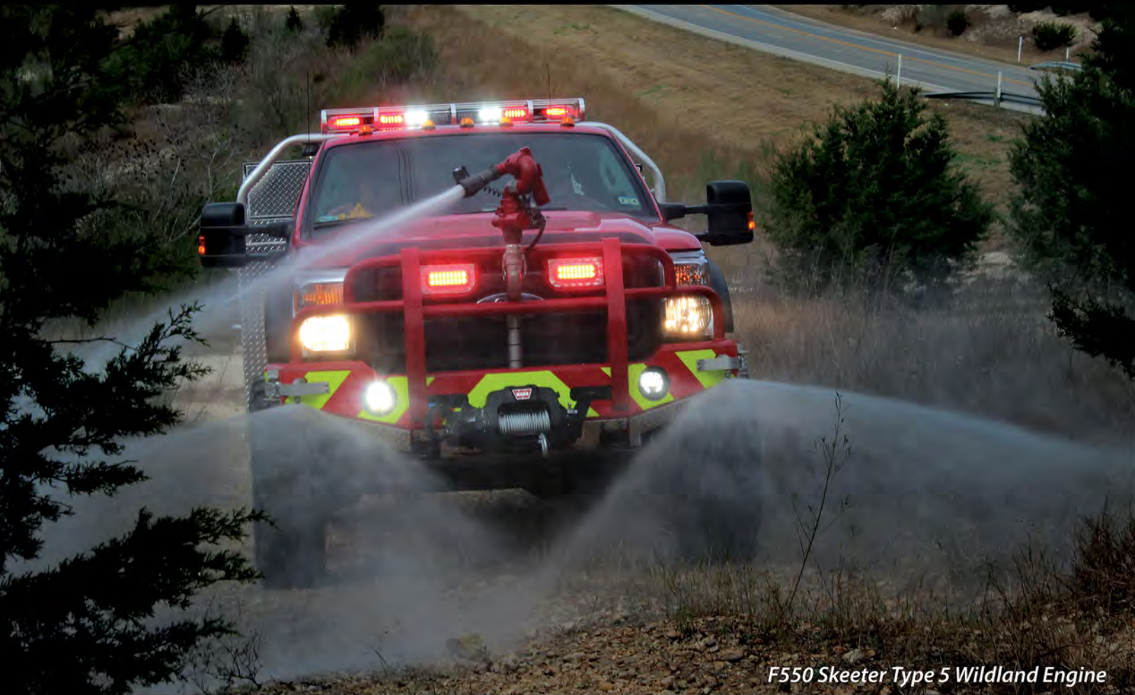
F550 Skeeter Type 5 Wildland Engine

WILDLAND ENGINE, FIRST RESPONDER, RAPID INTERVENTION UNIT