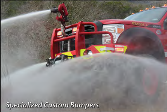
Specialized Custom Bumpers