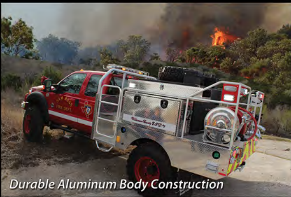
Durable Aluminum Body Construction