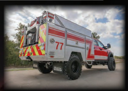
F550 Maximum Fording Depth: 32"

Dual Purpose Hybrid-Side unit with removable firefighting module can be quickly converted from a wildland resource to a rescue asset when needed