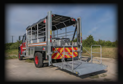
M2 Maximum Fording Depth: 42"

Exceptional ground clearance and handling packages, available on both small and large chassis options Camera and Intercom options allow for maximum situational awareness between your crew and their driver